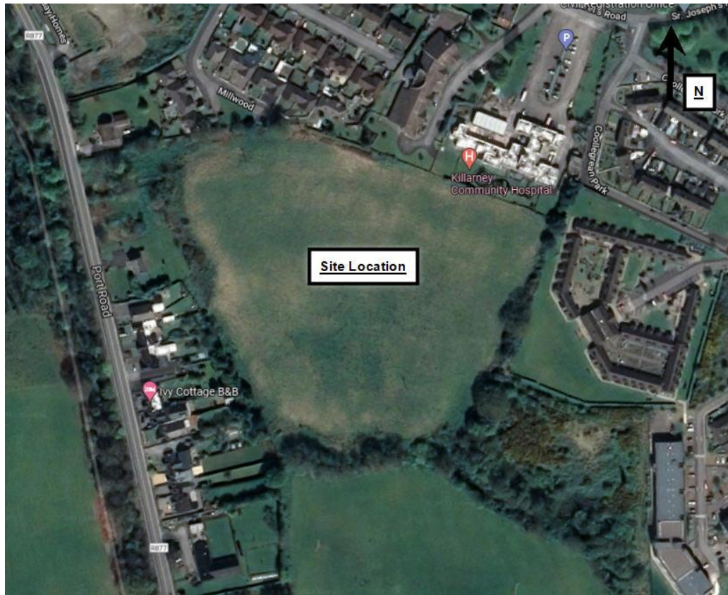
Figure 2 – Site Location